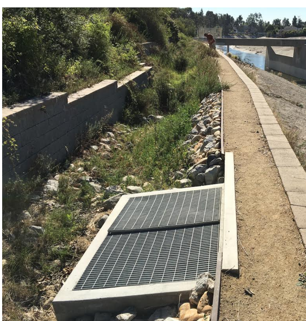
Figure 1: image of the Ballona Creek Rain Garden

In Spring of 2015, we met with representatives from Culver City to discuss current greening projects, such as rain collections cisterns. They were responsive to learning more about civic engagement and felt that such a study would be beneficial. Therefore, the results of the study could impact future City decisions, increasing the relevancy.